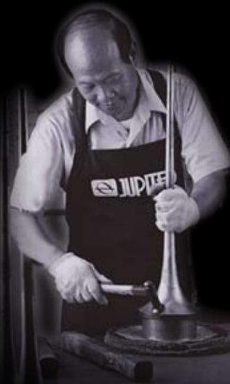
One Piece Hand Hammered Bell